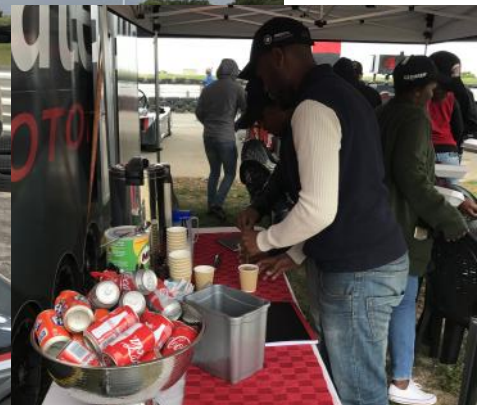
Lunch and refreshments were provided