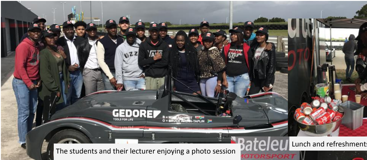
The students and their lecturer enjoying a photo session

The fourth event in the 2017 Young Motorsport Engineers Skills Development program took place this past weekend at the Aldo Scribante Raceway in Port Elizabeth. The students from the East Cape Midlands College were hosted by the Bateleur Motorsport Team and the merSETA.